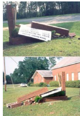
Church Sign After the Lightening Strike