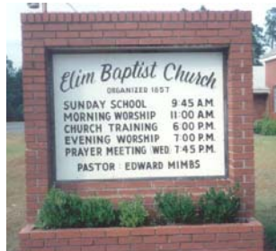
Church Sign Before the Lightening Strike

1992 Lightening struck the church sign and it crumbled to pieces.